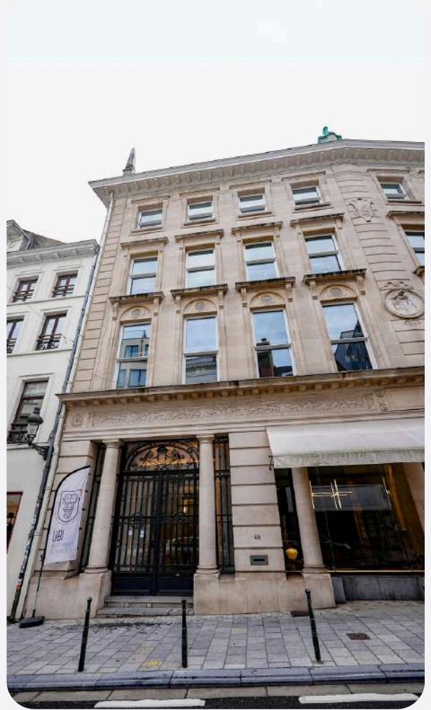
UBI Brussels campus

Demonstrating its dedication towards academic excellence, UBI Business School is a member of the United Nations' Principles for Responsible Management Education (PRME), driving thought leadership on sustainable management education and aligning with the work of the UN Global Compact.